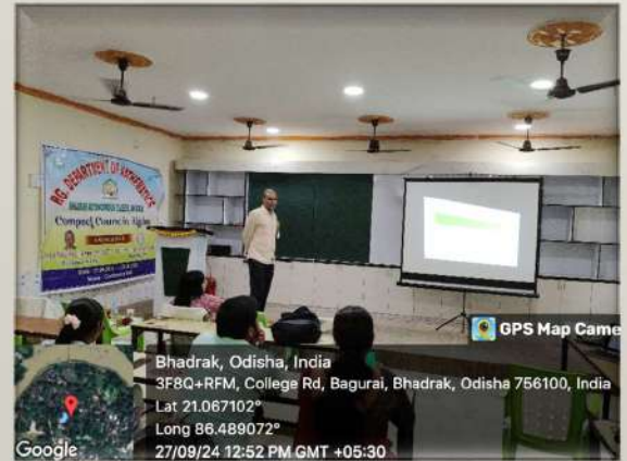
Bhadrak, Odisha, India 3F8Q+RFM, College Rd, Bagurai, Bhadrak, Odisha 756100, India Lat 21.067102° Long 86.489072° 27/09/24 12:52 PM GMT +05:30