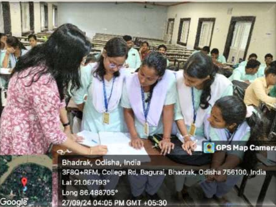
Bhadrak, Odisha, India 3F8Q+RFM, College Rd, Bagurai, Bhadrak, Odisha 756100, India Lat 21.067193° Long 86.488705° 27/09/24 04:05 PM GMT +05:30