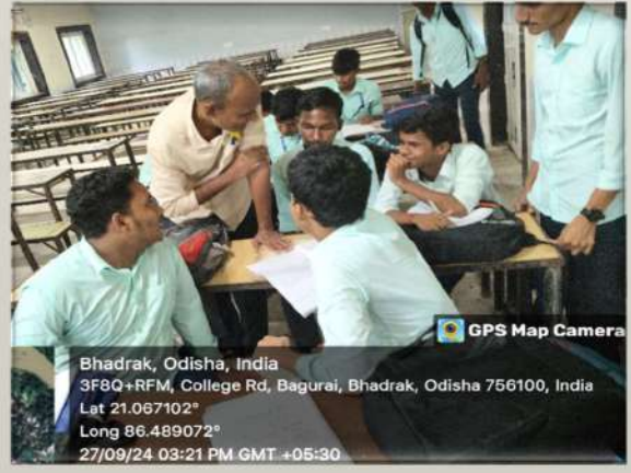
Bhadrak, Odisha, India 3F8Q+RFM, College Rd, Bagurai, Bhadrak, Odisha 756100, India Lat 21.067102° Long 86.489072° 27/09/24 03:21 PM GMT +05:30